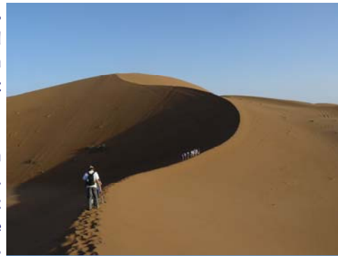
The Cheggaga Dunes—a 300m climb!

The next few days blurred into one. The scenery was breathtaking, alternating between undulating dunes sculpted by the wind and lunar like rocky plateaus. At times the physical exertion was challenging; scaling the breathtaking Cheggaga dunes and wading through soft sand in the unseasonably warm 30 degree heat was demanding, but