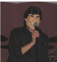
Mick Jagger performing for MNDA? See page 3...