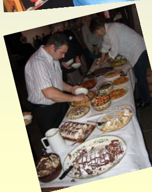
Below left: The delicious selection of desserts made by the committee members were a big draw.