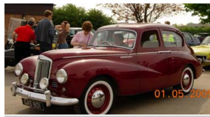
The Sunbeam Talbot 90