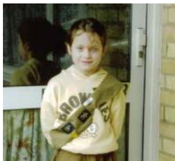
this lovely picture.